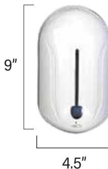
CSL TOUCH FREE DISPENSER WALL MOUNT