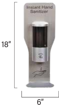
CSL TOUCH FREE HAND SANITIZER DISPENSER WALL MOUNT